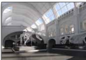
Visualizing project designs