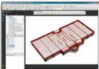
Produce intelligent 3D PDFs